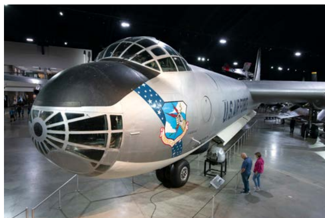
B-36 Peacemaker on display at the National Museum of the US Air Force in Dayton, Ohio.

The advent of World War II changed Gregory's life, as it did so many in the Greatest Generation, and the first third of Spying From the Sky recounts his pilot training and wartime experiences piloting a P-38 Lightning fighter-bomber. Although not directly relevant for those seeking to learn about intelligence collection, this section is nonetheless an exciting and insightful read into the sacrifices of the rapidly fading World War II generation. This material alone makes it an engaging read.