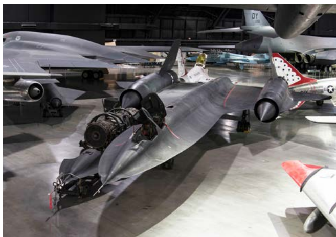
SR-71 BLACKBIRD on display at the National Museum of the US Air Force.

in town. Richardson tells this story in a thorough and engaging way.